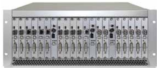
KVM TRANSMITTER FRAME

In addition to platform options for the matrix switch, there are options for the KVM transmit units, as well. High-density, card-based solutions are available for the KVM transmit modules. These frames decrease the space required by the KVM transmitters while simplifying installation and providing redundant power supplies to the active components.