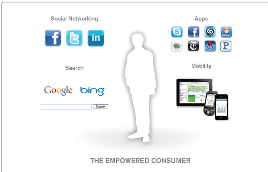
Figure 2: Empowered consumers are driving change