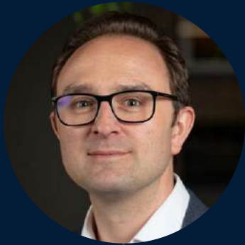
BY TOM CHEESEWRIGHT APPLIED FUTURIST

Even before the pandemic, the nature of work was changing because the nature of business is changing. Low-friction communications technology has compressed our world and lowered the barriers to cooperation.