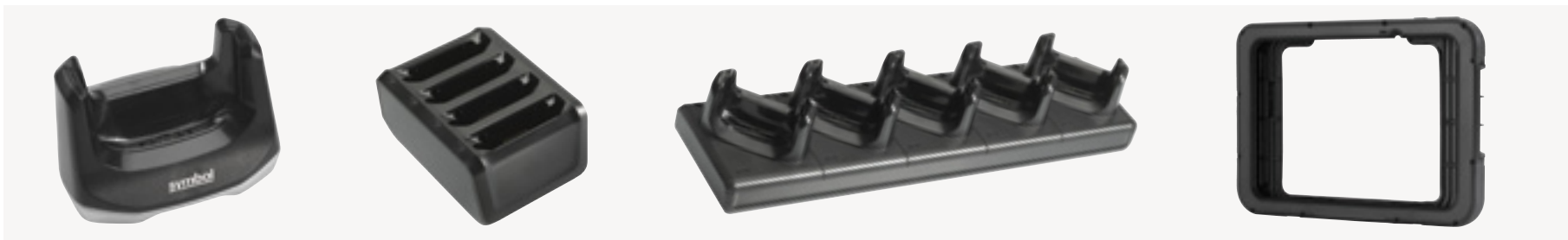
MC40 Single Slot Cradle

Mobile device power management accessories should be built to business grade specifications, such as insertion ratings, as well as for space and cost efficiency in the backroom.